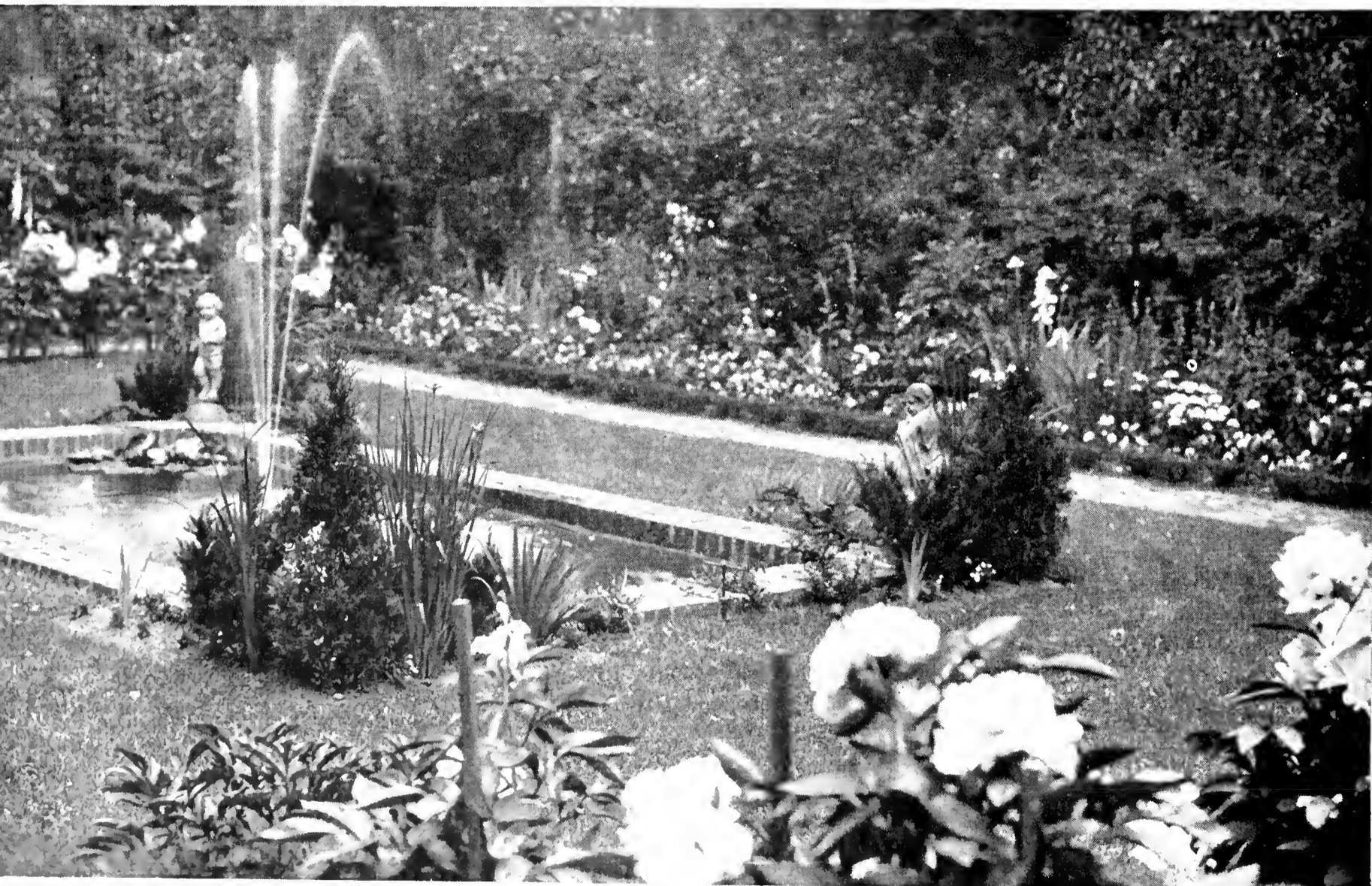
In the garden Peonies have no equal.